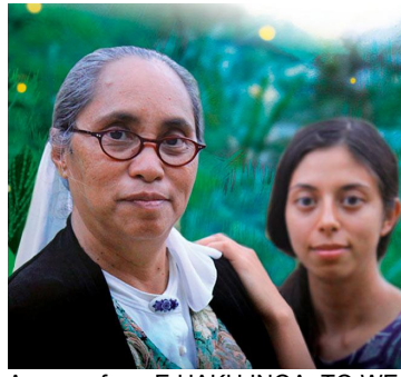
A scene from E HAKU INOA: TO WEAVE A NAME , a documentary directed by Christen Hepuakoa Marquez.