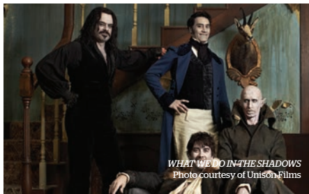
WHAT WE DO IN THE SHADOWS

Director: Himiona Grace. New Zealand. 2014. 93 min. SEP. 13 at 1pm • SEP. 17 at 7:30pm