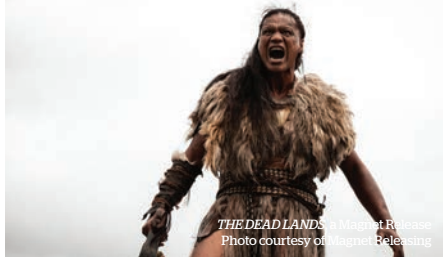
THE DEAD LANDS

Dir: Rebecca Collins ( Te Rarawa [Ngāti Te Reinga] ). New Zealand. 2013.