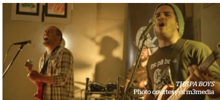
THE PĀ BOYS

Director: Toa Fraser. New Zealand. 2014. 109 min. Māori with English subtitles. SEP. 12 at 7:30pm • SEP. 13 at 4pm